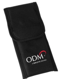
Single-instrument padded carrying pouch included.